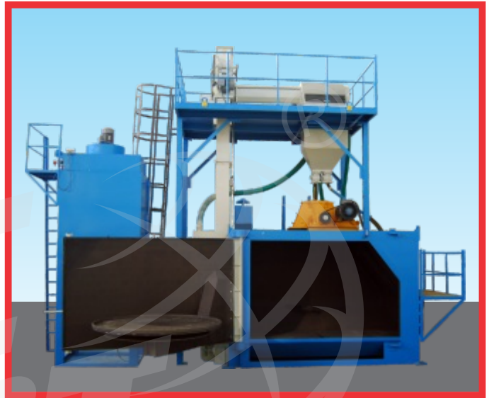
Airless Shot Blasting Machine Swing Table Type MODEL AST-1800

"MECSHOT" manufactures wide range of door mounted 30" to 96" diameters swing tables type shot blasting machines having light weight capacity of 350 Kilograms To heavy weight capacity of 4500 Kilograms, weight components, which are the conventional, most economical low powered and commonly used machines by a small, medium and large scale foundries, heavy machineries as well as various types of industries.